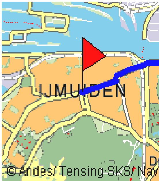
Within the area IJmuiden